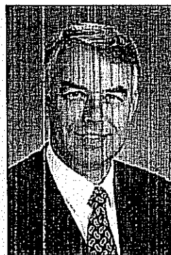
24 Years Specializing in Mediation!